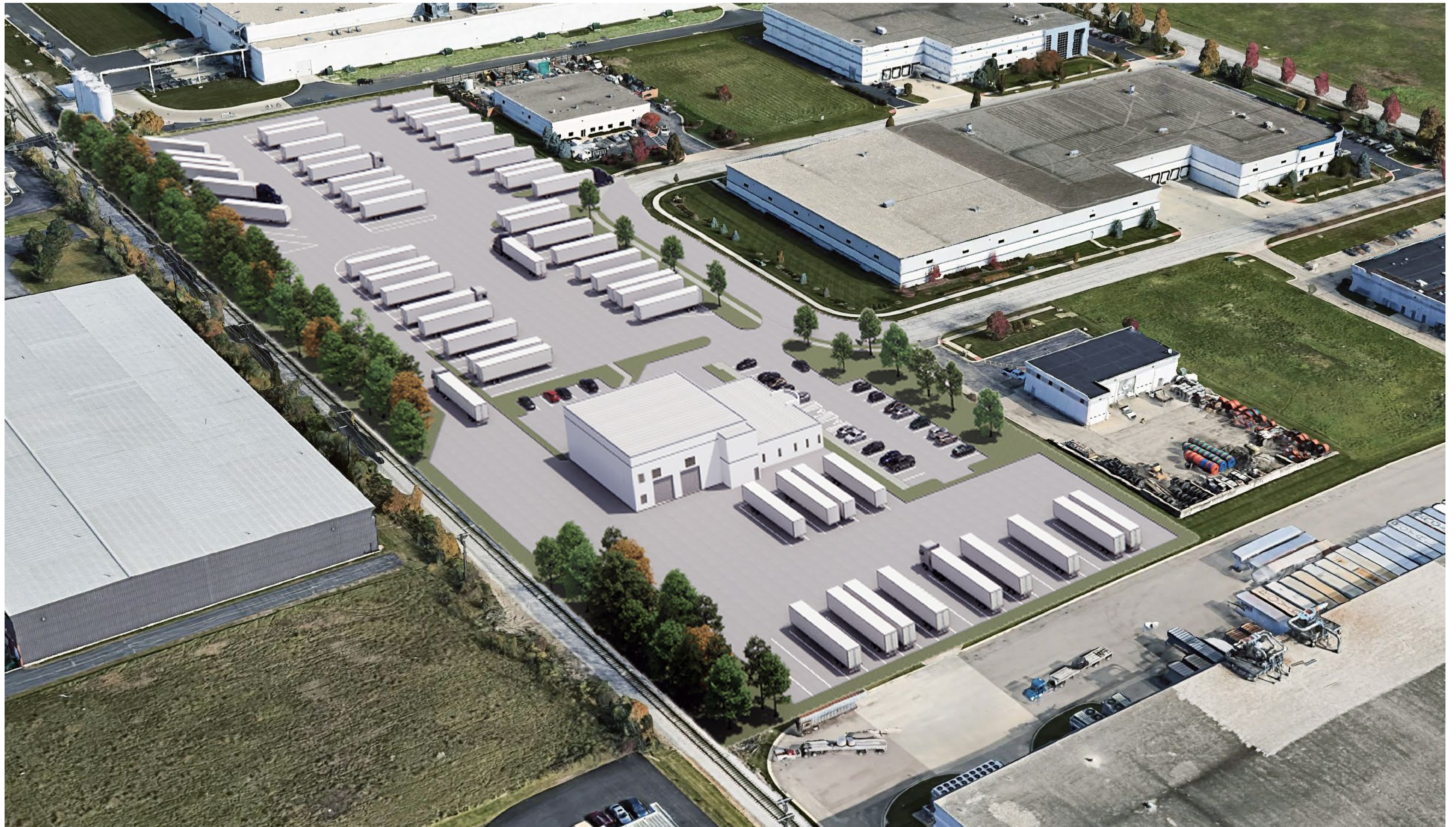
SOUTHWEST RENDERING VIEW