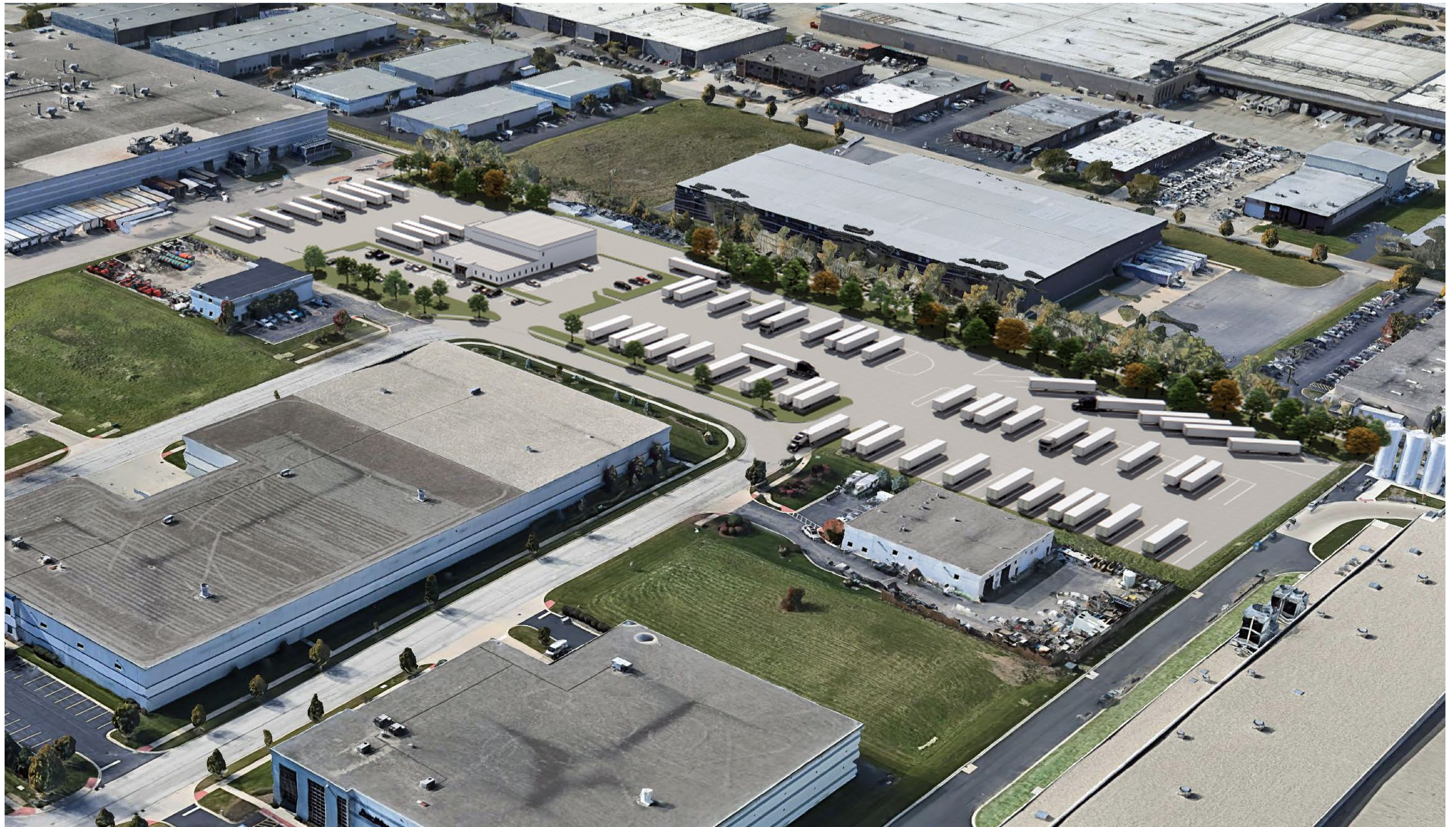
NORTHEAST RENDERING VIEW