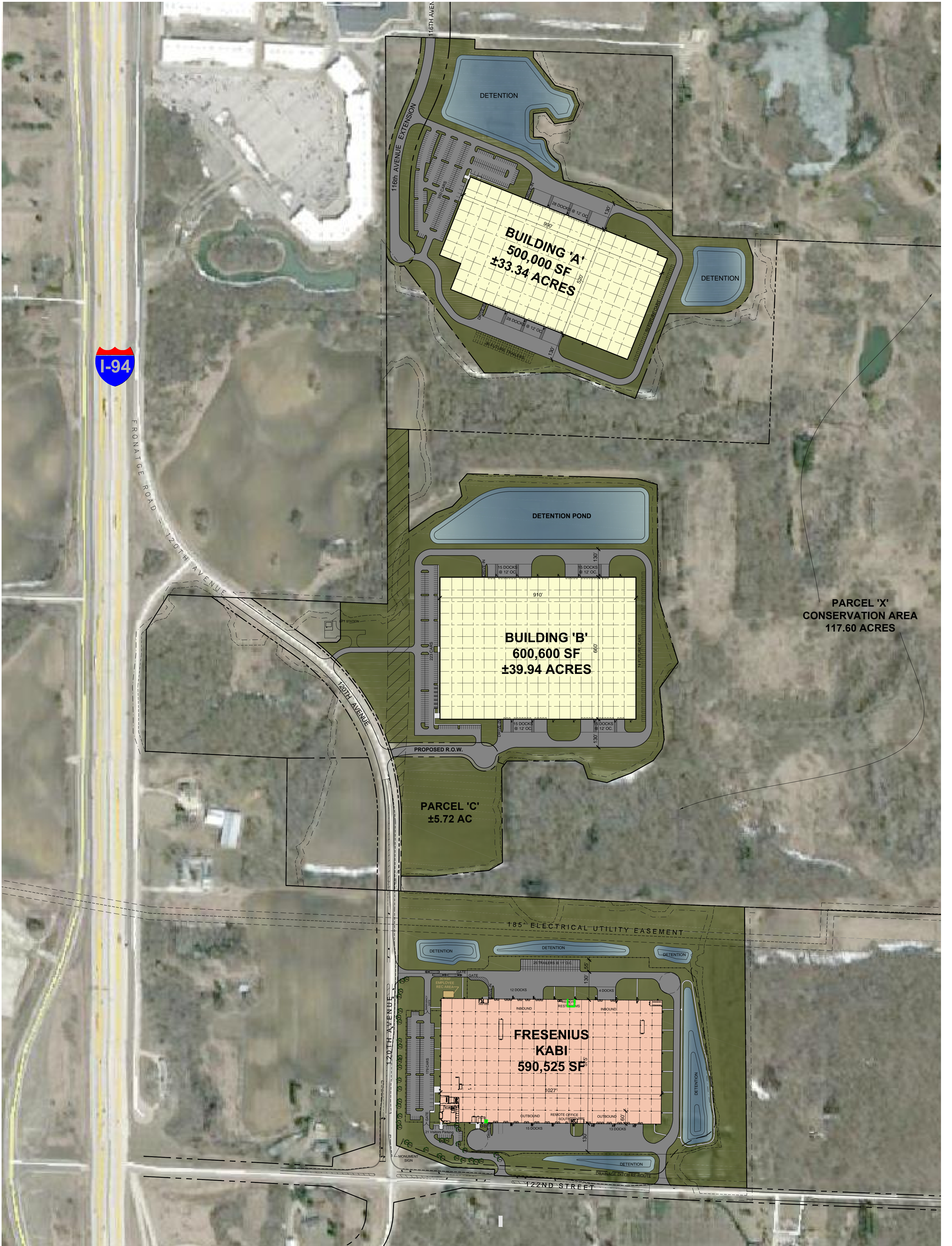
SITE PLAN 1" = 200'-0"